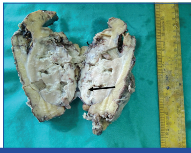
[Table/Fig-1]: Multiple air collections in renal parenchyma and perinephric region suggestive of emphysematous pyelonephritis (computed tomography). [Table/Fig-2]: Gross specimen of left kidney shows patchy areas of hemorrhage and necrosis in the cortex and medulla.